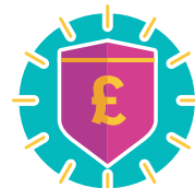
How to stay safe