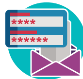
Phishing & smishing