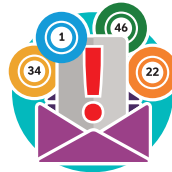
Prize draws and lottery scams