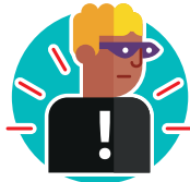
What is fraud?

Unfortunately, wherever there is money there will also be fraud and scams. Thankfully, many of these frauds and scams are well known and there are signs you can look out for to prevent yourself from being caught out.